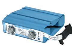
Wedge & Wedgekit